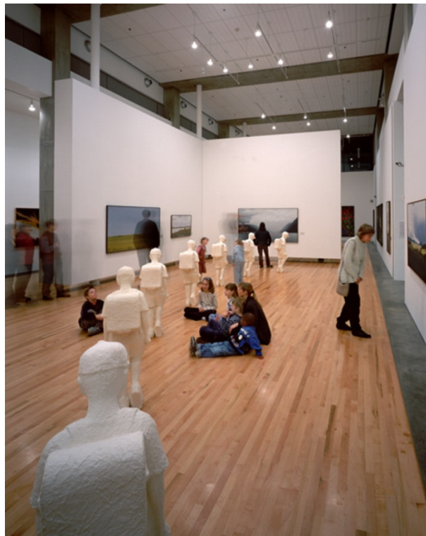
Main gallery.

Not for profit groups should contact KAG for current rate discounts.